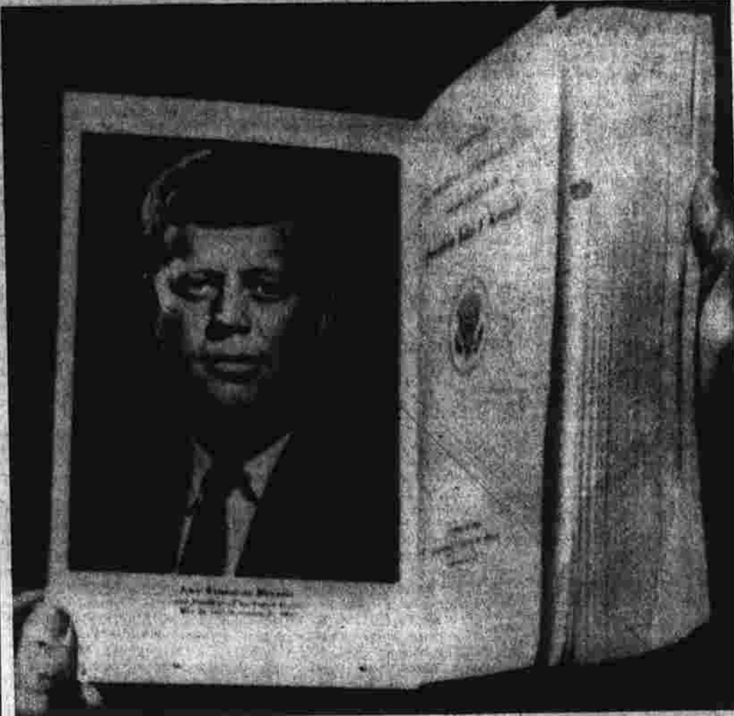
The Warren Report — to JFK and a Nation

Overseas, the British press generally agreed that the commission came up with an honest and competent report. But the report was denounced by the Communist press. The Warren report pinned